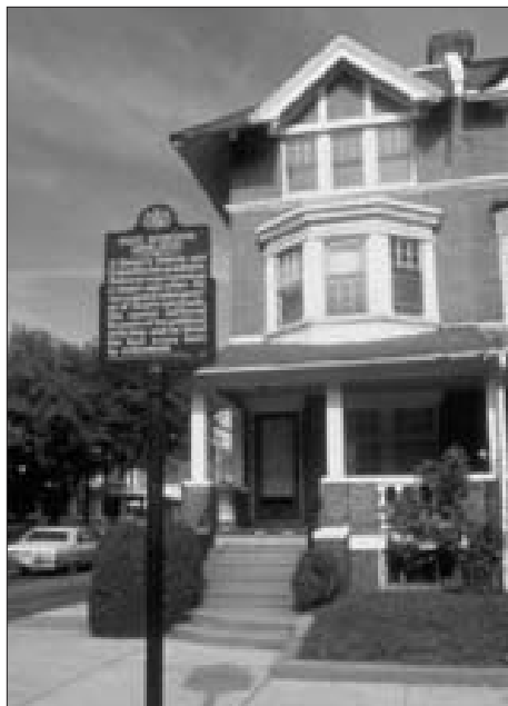
Paul Robeson house 4951 Walnut Street.

The project will entail three phases established by a master plan developed by Philadelphia architectural firm Kelly/Maiello and exhibit designers Ueland Junker McCauley Nicholson (UJMN): the restoration and sta-