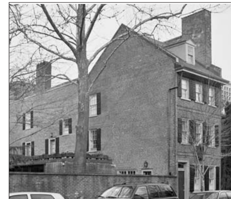
CLOCKWISE FROM ABOVE: 320 South 4th Street, 240 South 3rd Street, 264 South 3rd Street and 261 South 4th Street.

264 South 3rd Street was built in 1815 and is known as the Francis Borden residence; Francis Borden was a bricklayer. The town-